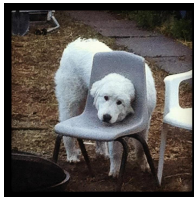
But this WAS the fastest way to get to the treat!